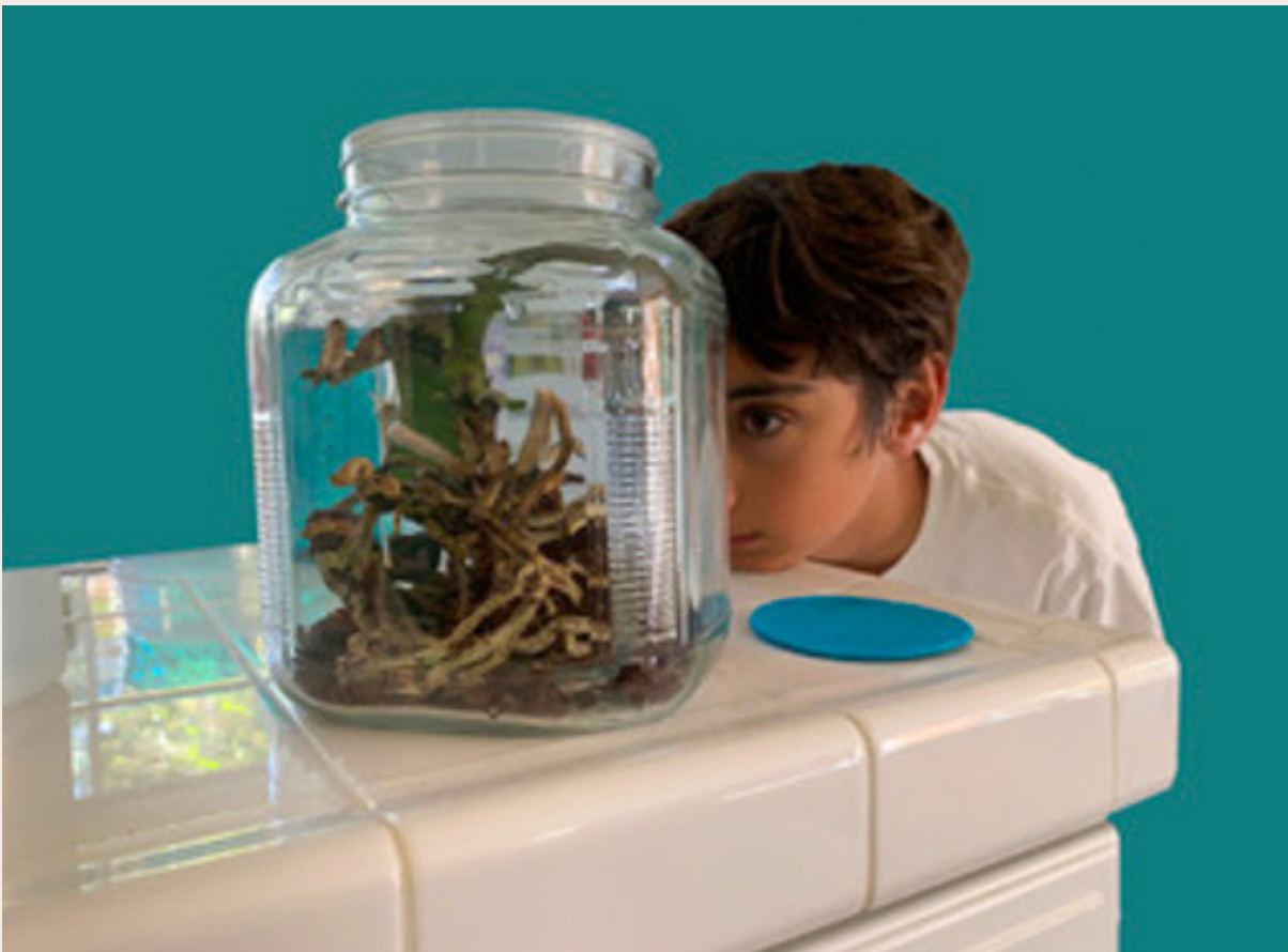
The mantis and the moth.