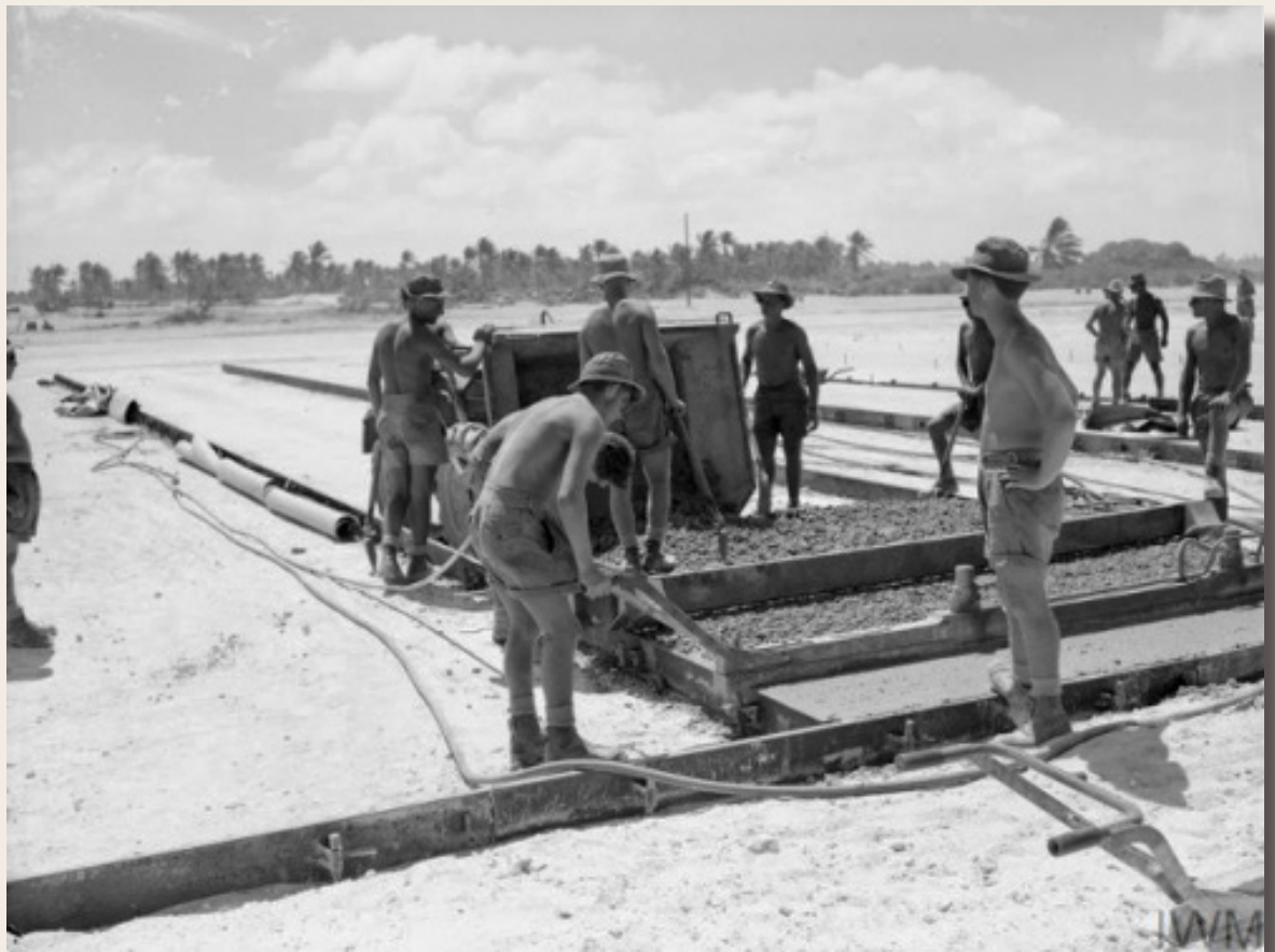
Hauling sugar cane on a prison farm (no date).

He moves along, placing a letter down before me. September 20, 1957. 4 The Colonial