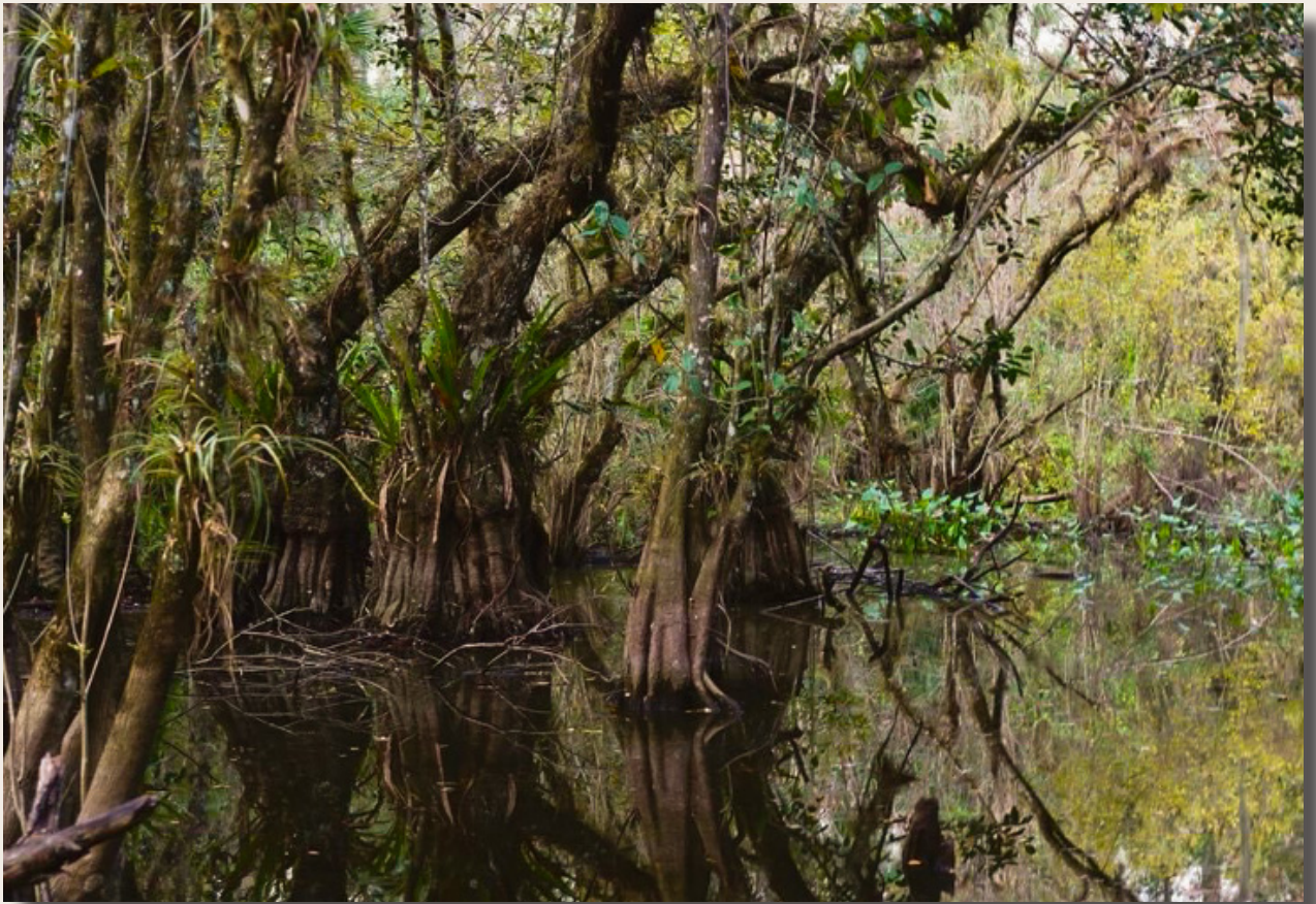
Cypress Trees. Kissimmee Billie Slough, Big Cypress Seminole Indian Reservation.