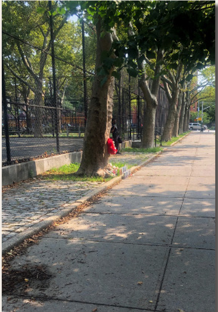
The Park.

I don't expect to find any mention of the shooting on the news, doubting if another street shooting in Brooklyn is noteworthy to people in the media who assess which traumas are legible, which worthwhile to cover. So, I log on to the Bedford-Stuyvesant Facebook page where I find a post about the shooting. Scrolling a few comments down, it is revealed that the victim was a child. I inhale the details: a bullet...ongoing tensions between 'gangs'...a one-year-old shot and killed on impact in his stroller...a family in the park. And exhale the analyses: why were they out that late with a baby? this is what happens when babies have babies. that park is a mess. ya'll still want to defund the police?