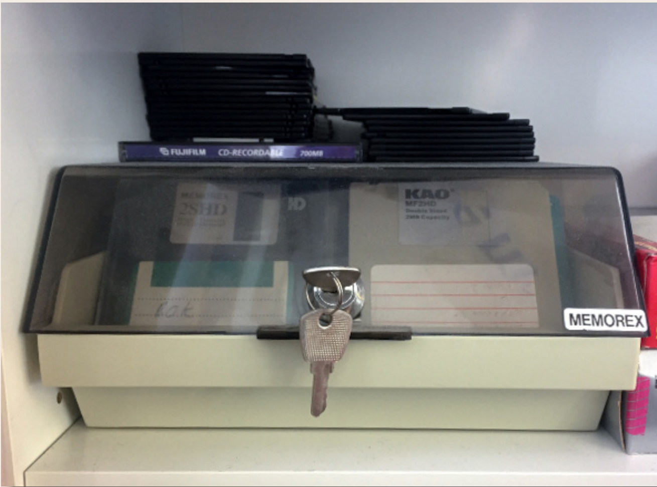
Locked floppy disk box.

Cohorts and variables, double click, open the spreadsheet. Numbers in boxes: income, age, postal codes. This is how you become an economist.