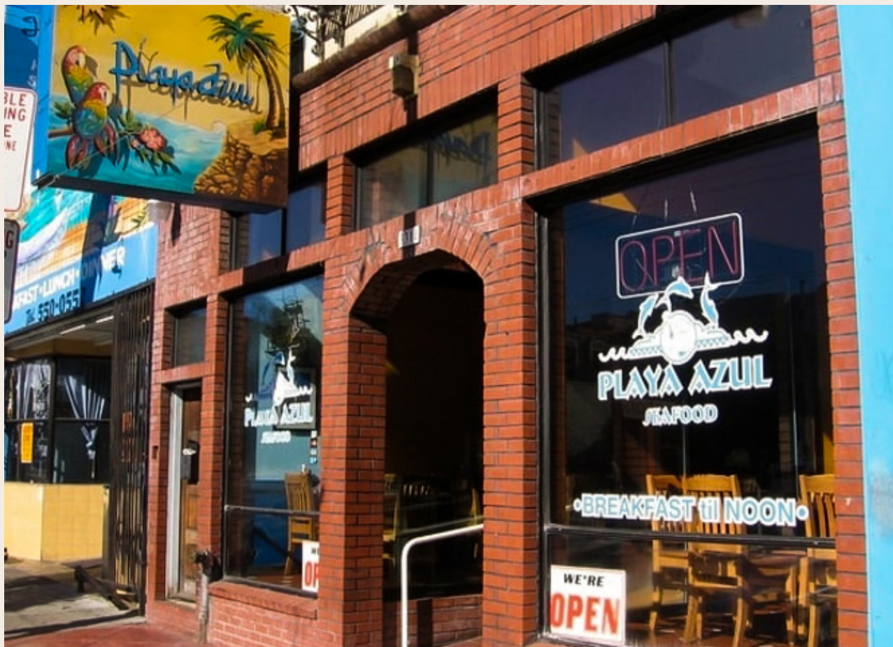
Playa Azul, the Mission, San Francisco.

receipts, or warranties. No red tape, W-2s, or taxes. It's a world of caveat emptor —buyer beware—and seller beware too, where anyone can get royally screwed. A world of pimps, prostitutes, pusher-men. Of grandmothers peddling tamales from pushcarts, and shivering day laborers huddled on street corners. It's a tough world.