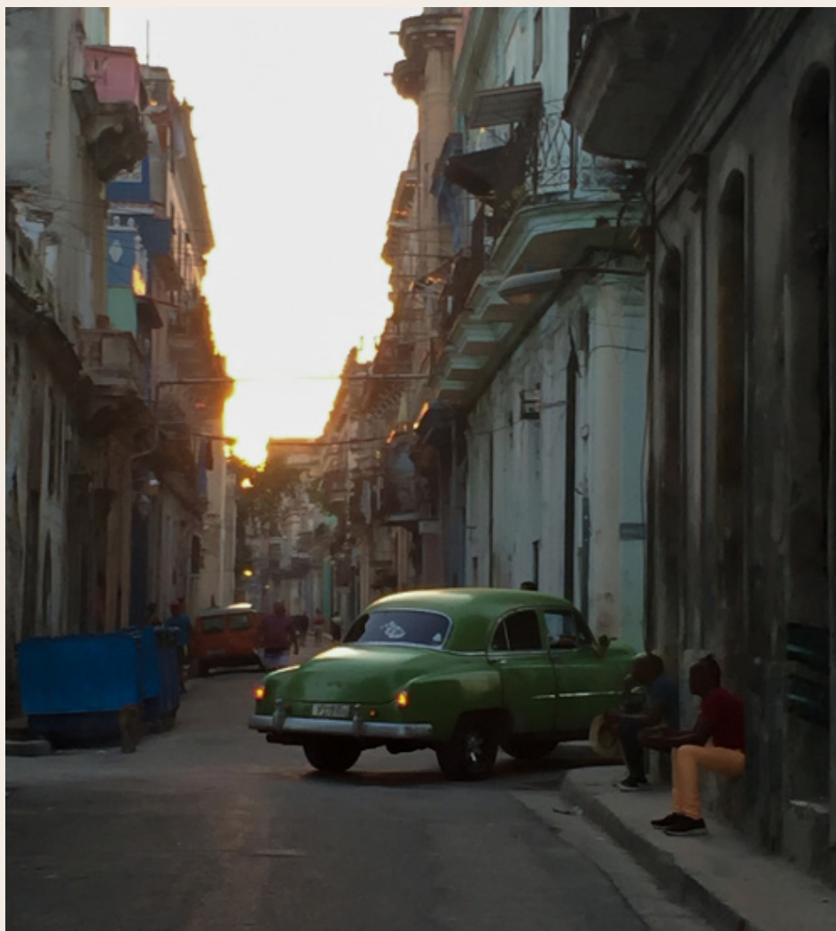
Havana, March 2020.

I started dreaming aloud. "I want a place like this, so I can come to Cuba and be here