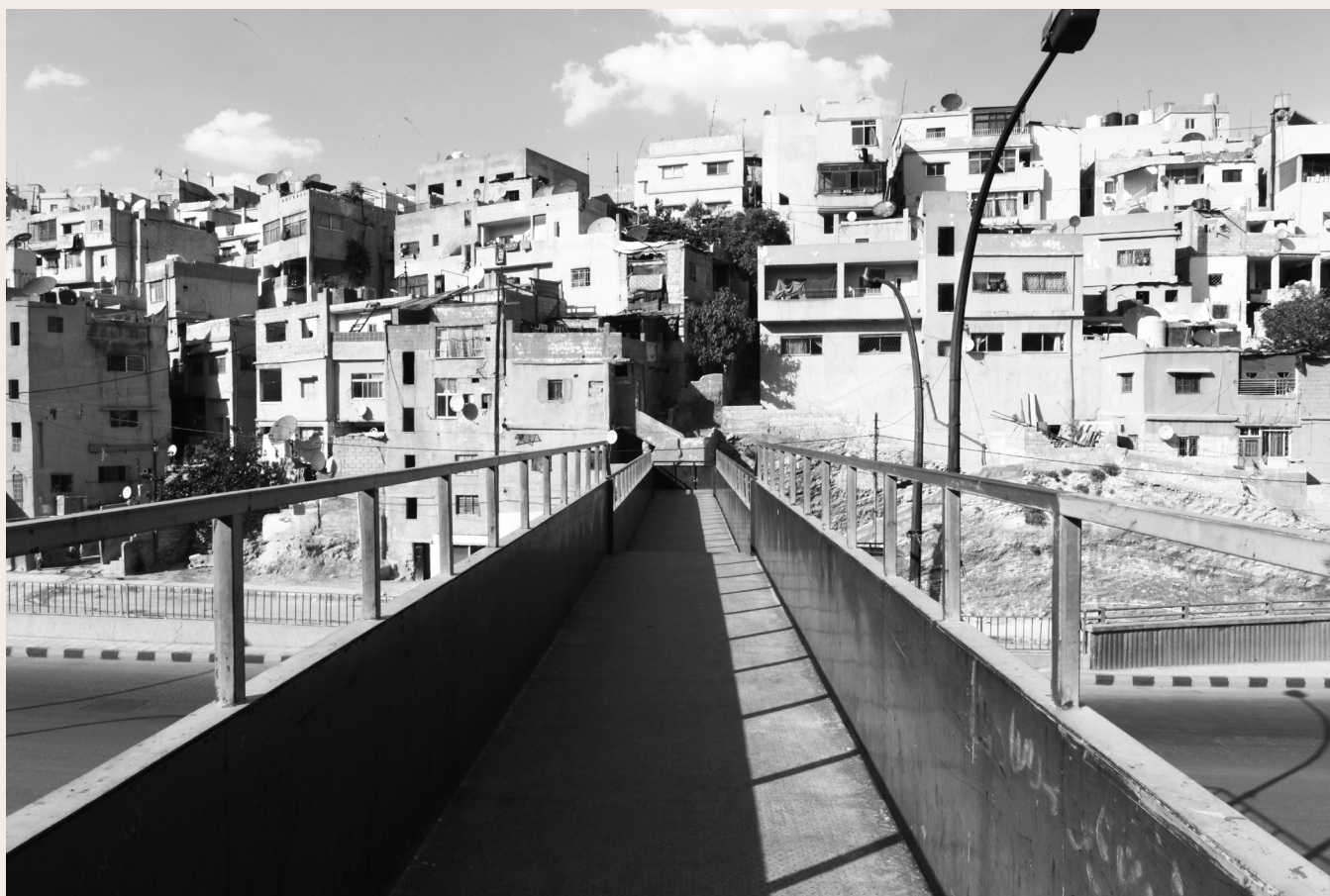
Amman, Jordan.

The most horrible thing that ever happened to me was the moment I tripped while walking down a frozen sidewalk in Amman, Jordan. I had not yet found the conceptual framing to articulate the confluence of war and climate change. I did not have words like “anthropocene” or “sociocide.” I only had words like “cold” and “war.”