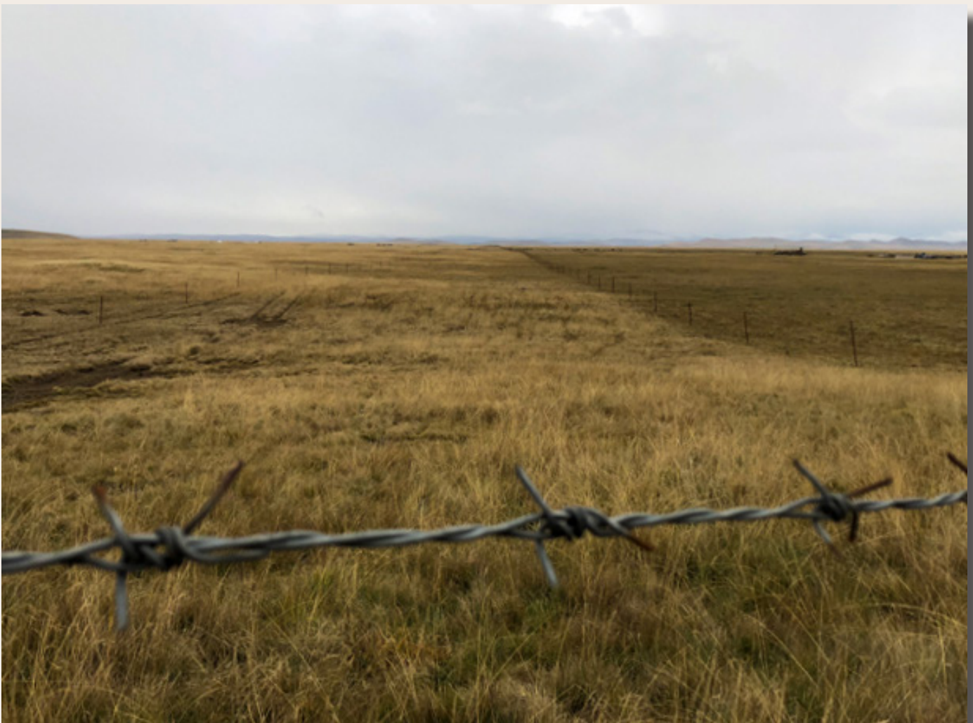
Tibetan grasslands.