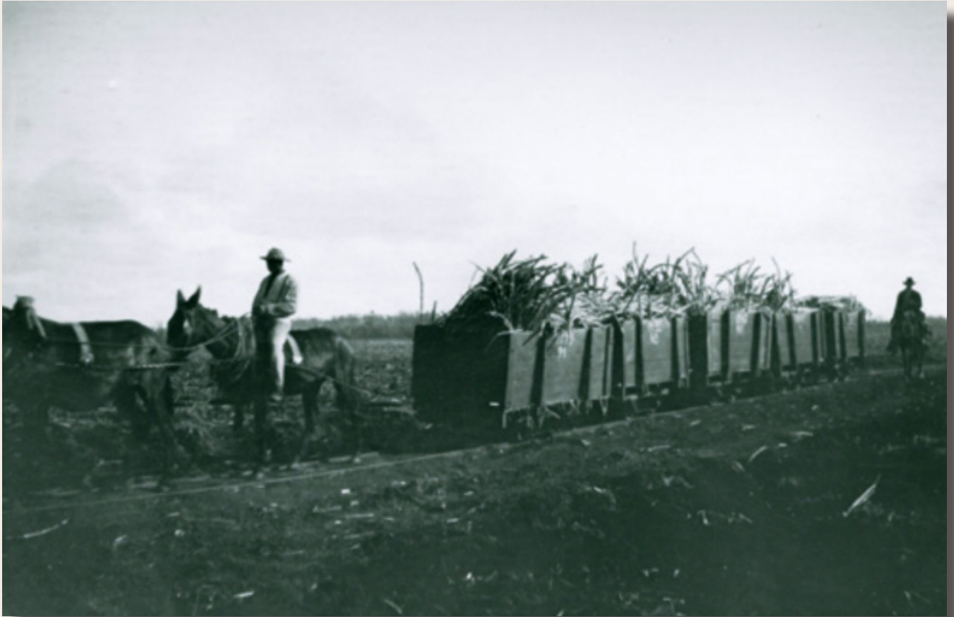
Hauling sugar cane on a prison farm (no date). Prints and Photographs Collection, 1976/31-168, Texas State Library and Archives Commission.