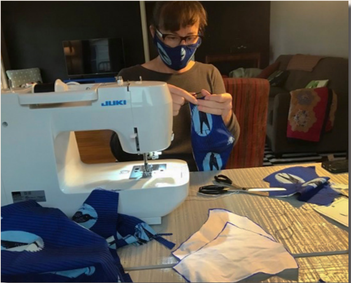
Pandemic Days.